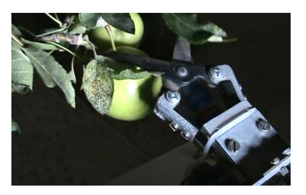
Figure 4. Cutting for apple