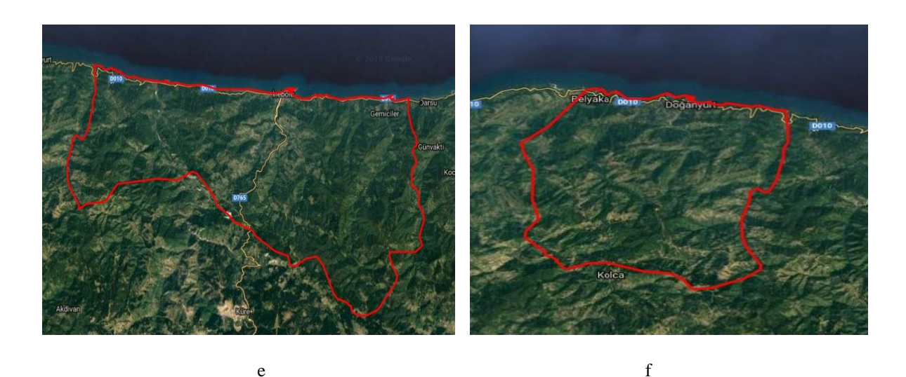
Figure 1. Geographical regions where chestnut honey samples were obtained (a: Abana; b: Bozkurt, c: Cide, d: Küre, e: İnebolu, f: Doğanyurt)