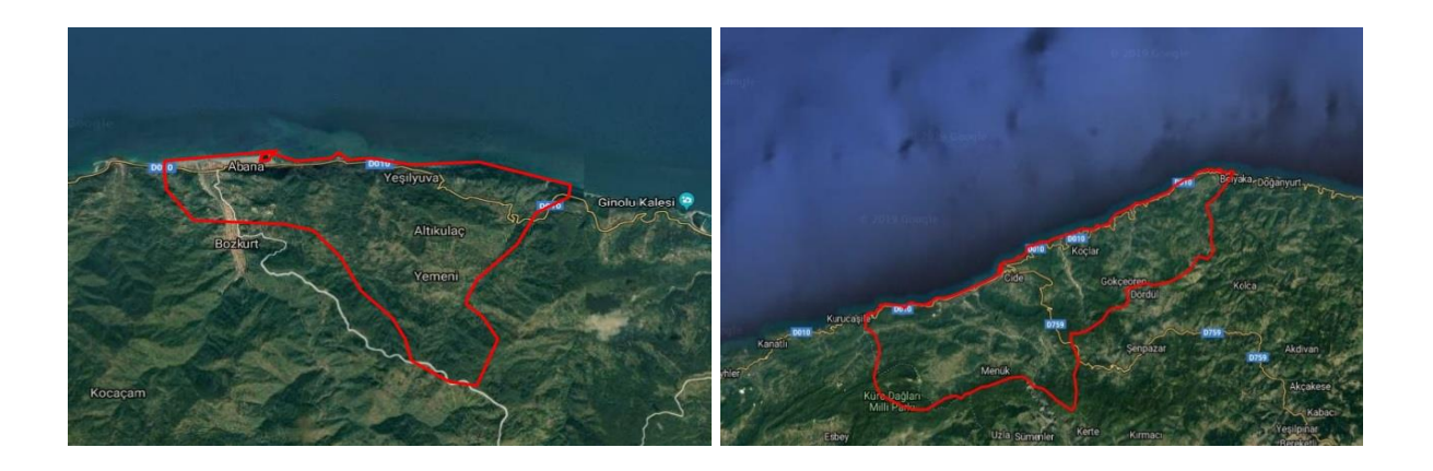
Table 1. Code and locations collected of the honey samples

Journal of Apitherapy and Nature/Apiterapi ve Doğa Dergisi, 6(2), 73-87, 2023 Uğur ERTOP, Hakan ŞEVİK, Müge HENDEK ERTOP