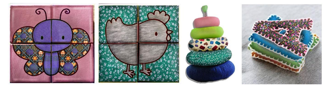
Image 2. Examples of trial molds for educational toy production.

In addition to baby and animal-themed toys, educational toys such as puzzles and fabric stacking rings were also produced within the scope of the project. Puzzles required assembling pieces to form a complete picture. Various animal images were used in the puzzle toys produced as part of the project. Through these puzzles, children not only develop their problem-solving skills and hand-eye coordination but also enhance their ability to focus. Moreover, children learn about shapes, colors, patterns, and object relationships through these puzzles. The fabric stacking rings, on the other hand, are toys used to improve children's hand-eye coordination and fine motor skills. By stacking the fabric rings of different colors and patterns to form a tower, children develop their skills in object sequencing, organization, and manual dexterity (Figure 2). After the production of samples, more than 1000 toys were made from 84 kg of knitted fabric by the researchers in the project design team, which were intended to be gifted to children during planned or unplanned project activities.