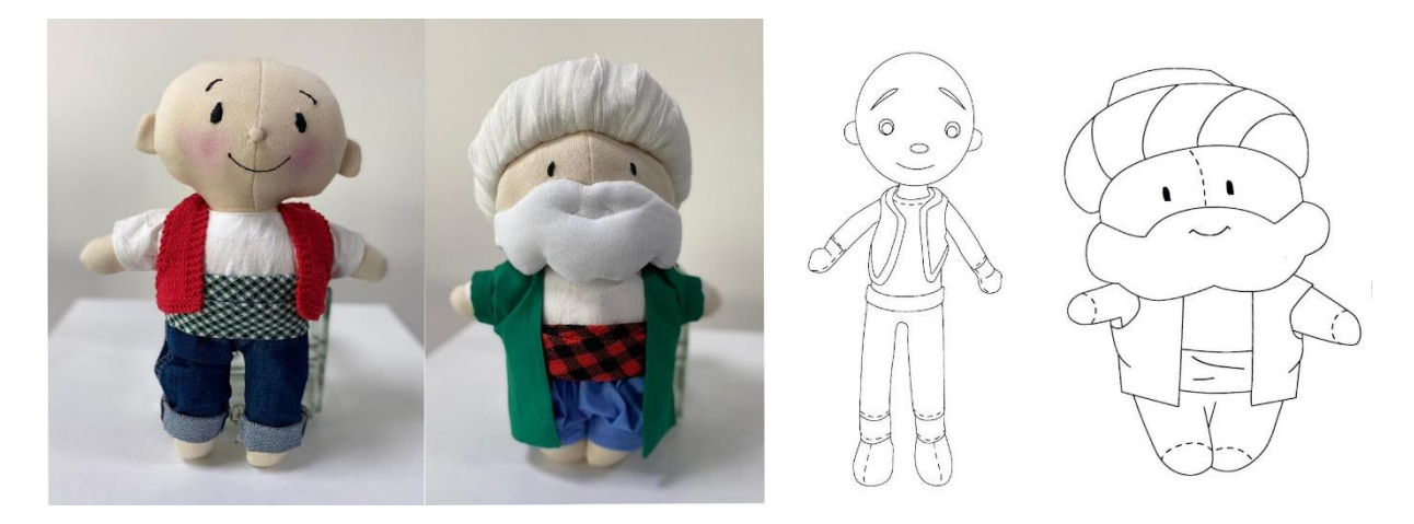
Image 11. Application of Nasreddin Hodja and Keloğlan fabric toy.