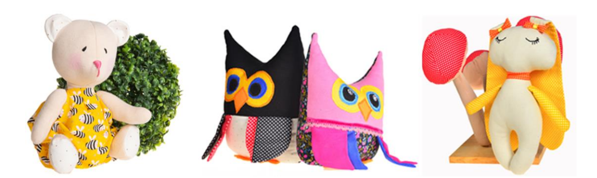
Image 6. Exhibition photographs of recycled toys.

The captured photographs and videos have been shared for the visibility and recognition of institutions such as Dokuz Eylül University, Faculty of Fine Arts, Children's Oncology Institute, and the project and stakeholder organizations (Figure 7).