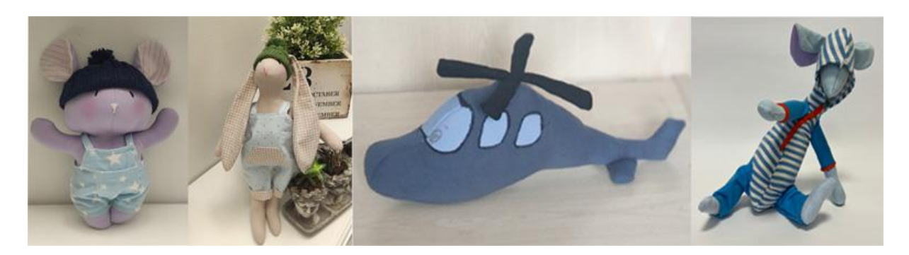
Image 1. Toy production mold trial samples.

In addition to baby and animal-themed toys, educational toys such as puzzles and fabric stacking rings were also produced within the scope of the project. Puzzles required assembling pieces to form a complete picture. Various animal images were used in the puzzle toys produced as part of the project. Through these puzzles, children not only develop their problem-solving skills and hand-eye coordination but also enhance their ability to focus. Moreover, children learn about shapes, colors, patterns, and object relationships through these puzzles. The fabric stacking rings, on the other hand, are toys used to improve children's hand-eye coordination and fine motor skills. By stacking the fabric rings of different colors and patterns to form a tower, children develop their skills in object sequencing, organization, and manual dexterity (Figure 2). After the production of samples, more than 1000 toys were made from 84 kg of knitted fabric by the researchers in the project design team, which were intended to be gifted to children during planned or unplanned project activities.