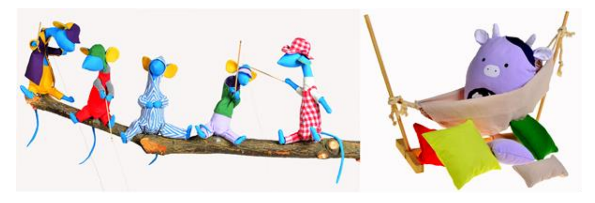
Image 7. Exhibition photographs of upcycled toys (Project archive, 2022).

The photographs of the toys produced in the project have also served as a means of preserving the project's memory. As part of the social responsibility and project requirements, the toys are distributed, and only the photographs remain. The photographs have become a creative source of data for the design of new toys, ensuring the preservation and development of originality to avoid repetition in the realization of the imagined. Due to the interdisciplinary nature of the project, the photographs are used as a supportive media in which all stakeholders can benefit, serving as a mediated form of the generated knowledge. Furthermore, the production process of the fabric toys, the use of recycled materials, the handcrafted nature, and adherence to sustainability principles have been documented through photographs. In the future development of the project, the photographs can be utilized as ready-made resources to support entrepreneurial positioning and marketing strategies.