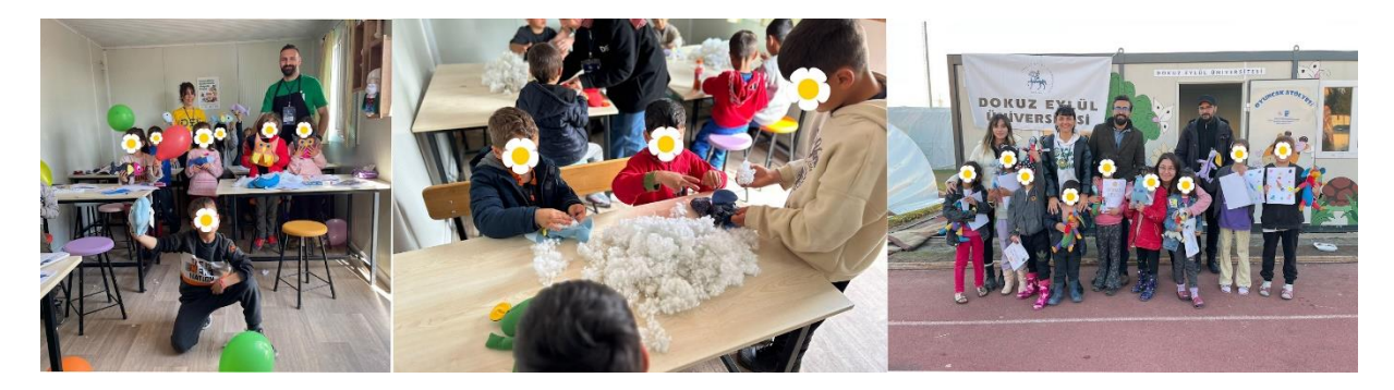
Image 9. Adıyaman eğriçay park, 7earthquake zone.

Following the devastating earthquake disaster that deeply affected Kahramanmaraş and 11 other provinces, causing nationwide mourning in Turkey, Dokuz Eylül University contributed to the psychosocial activities by sending aid and support teams to the earthquake-stricken areas. As part of the efforts to provide support and morale to the children in these regions, the "Toy Workshop" of the project was relocated to Adıyaman with the support of the University's Faculty of Fine Arts faculty members and volunteer students (Figure 9). Supported by the University's own resources within the framework of Dokuz Eylül University Scientific Research Projects (BAP), the Toy Workshop was established in the earthquake zone 7 area in Adıyaman, where children had the opportunity to create toys using non-toxic and antibacterial fabrics. The design of the Toy Workshop was entirely child-oriented, creating a pleasant and comfortable environment for them. In the aftermath of the major disaster, our volunteer academicians aimed to support the children by providing them with our handmade fabric toys, helping them overcome their pains and fears and bringing a little smile and happiness to their faces. Hundreds of children affected by the earthquake have participated in the production of fabric toys as part of the workshop activities and have received these toys (Figure 9).