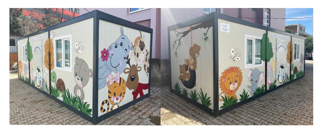
Image 3. Visual design of the toy workshop (Project archive, 2022).