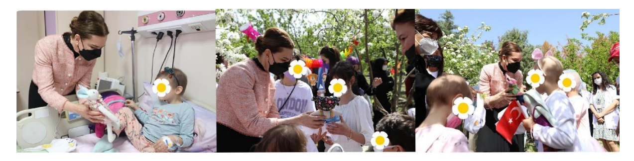
Image 4. Visit to deu children's hospital institute of oncology on April 27, 2022.

The Project, supported by Dokuz Eylül University, which continues its academic and scientific activities with a sense of community service, was introduced to the audience and national media through an organized exhibition. The Sustainable Stories Exhibition with Toys took place in the foyer area of Dokuz Eylül University's Cultural Heritage Rectorate Building from June 20, 2022, to July 4, 2022 (Figure 5). The fabric toys, produced by expert academics within the project, were designed in different characters by five project team members who are faculty members of DEU Faculty of Fine Arts Fashion Design Department. The exhibition aimed to raise awareness of conscious consumption of limited resources for future generations and featured 64 upcycled fabric toys. Plastic toys, which contribute to global warming and are made of toxic materials and chemicals, are difficult to recycle.