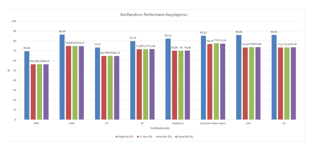
Figure 4 – Classifier performances