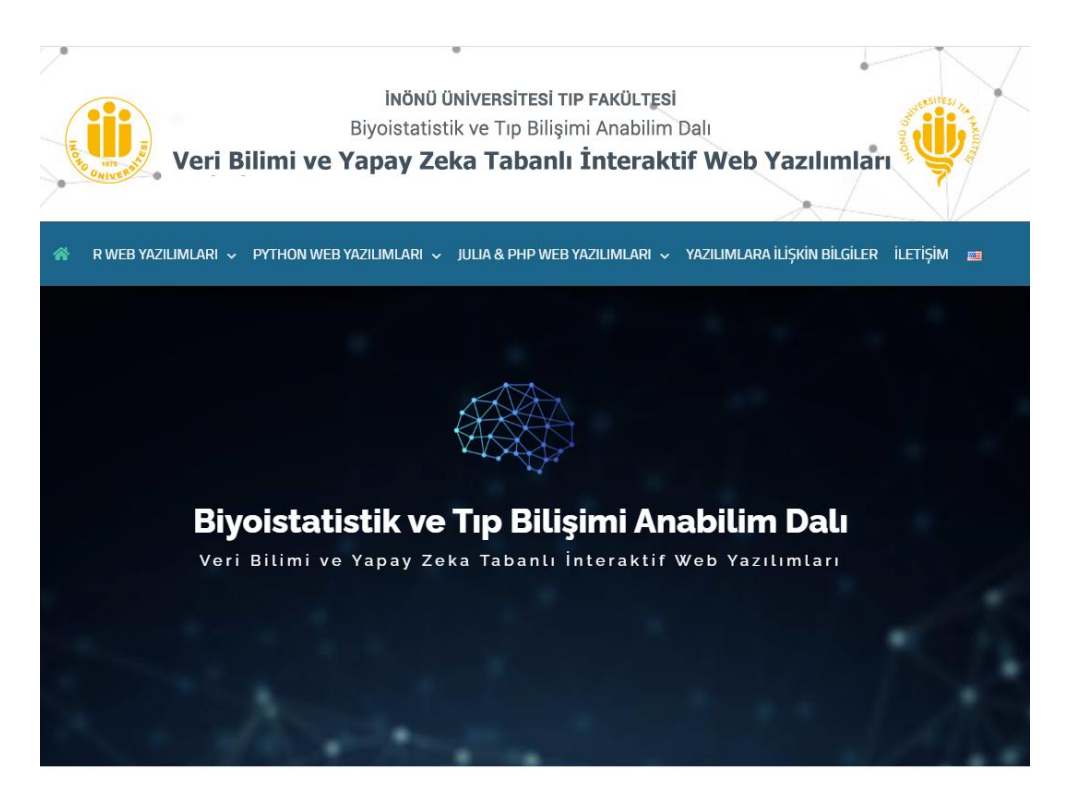
Figure 1. Interface of Interactive Web Software

Association Rules Mining, Data Classification Software, Cluster Analysis and Regression Analysis software are available in the Julia Web Software menu. Figure 2 shows the interface of the Classification Software.