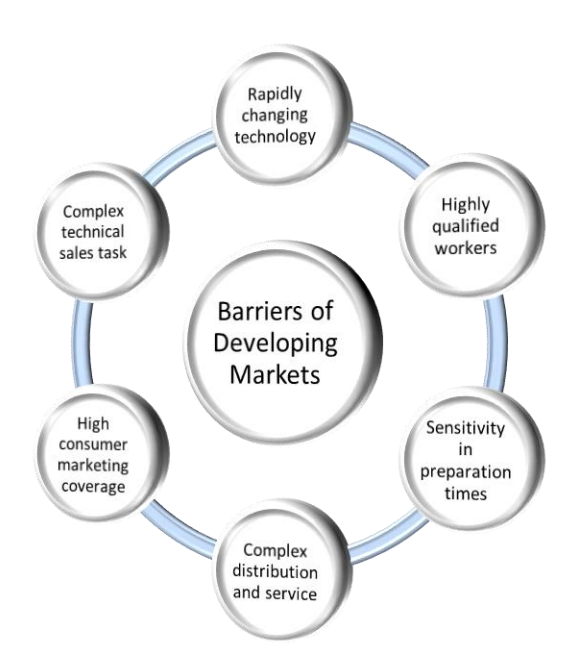
Figure 1. Potential Barriers of Developing Markets

One of the main tasks of developing countries is to create a favorable environment for investors, considering that this is one of the methods to ensure more significant capital inflows (Domazet and Marjanović, 2018). Traditionally, developing countries have competed based on cheap labor and natural resources, which is continuing. However, the competition of developing countries is making an evergreater impact in capital-intensive sectors, such as shipbuilding and television sets, steel, fiber, and even the production of cars. Developing countries take significant risks because of some of the ideas presented above. The sectors that are most exposed to the competition of developing countries are the sectors that do not have the following entry barriers (Bulut, 2004):