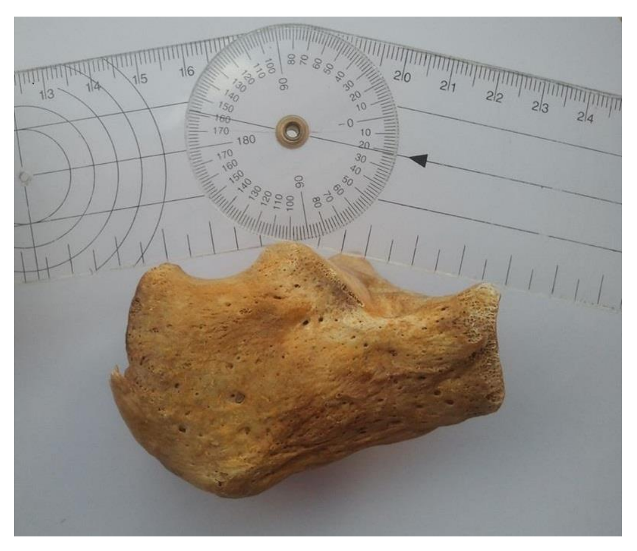
Figure 2. Boehler'sangle: Theselines are;1-superior magrin of posterior facet to superior magrin on anterior process 2-superior magrin of posterior facet to superior magrin of tuberosity

A sliding caliper with sensitivity of 0.1 mm was used in linear measurements and a goniometer was used in measurement of Boehler's angle. All calcaneus data was analyzed in order to determine right-left differences. Correlation of Boehler's angle and MAXL data with other measurements of the bone was examined. Regression of MAXL measurement of calcaneus with other bone measurements was evaluated. In statistical analyses, SPSS (version 14) was used.