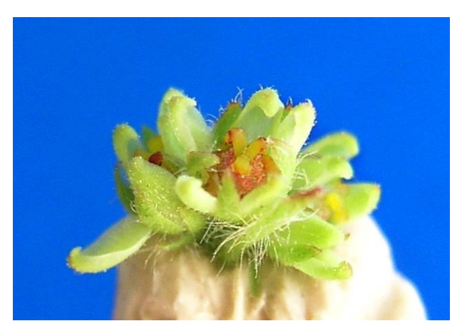
Fig. 6. The pistillate flower of R. typhina.