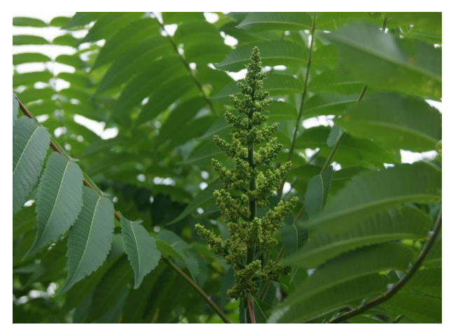
Fig. 5. Inflorescences with staminate flowers of R. typhina.