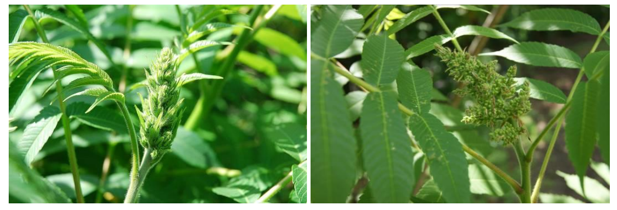
Fig. 2. Bracts of R. typhina.

Pistillate flowers are collected in dense inflorescences. In one inflorescence there are 231\pm47.57 of flowers that have a white-green color (Fig. 6). After fertilization, they acquire a carmine color. The shape, size of the calux and corolla are similar to staminate flowers. Gynoecium monocarp. According to the location of the pistil in the flower, the studied plants have pistillate flowers. The ovary of the pistil is upper, the column is apical, stigma is triple-cutted. The flowers have reduced stamens with underdeveloped anthers.