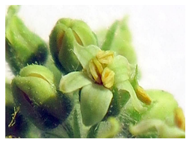
Fig. 4. Staminate flower of R. typhina .