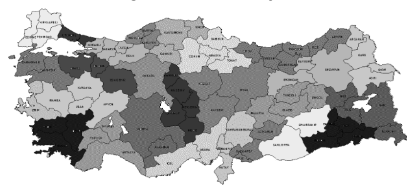
Figure 3: NUTS Level 2 Regions