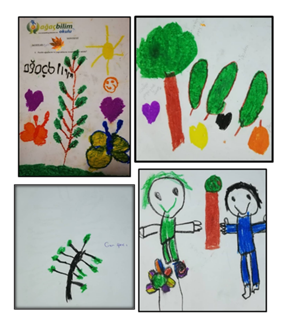
Figure 2 shows the results of the project's effectiveness based on the technique of drawing and explaining the activities used in the project in the recognition of trees by preschool children who participated in the project.