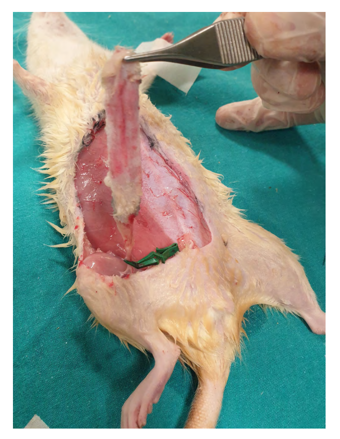
Fig. 1 After flap elevation, the pedicle was clamped to create ischemia