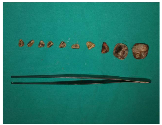
Fig. 2. Extracted residual gallbladder stone images

The results of studies have revealed that gallbladder